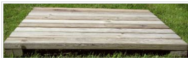
55MM DECKING TILES